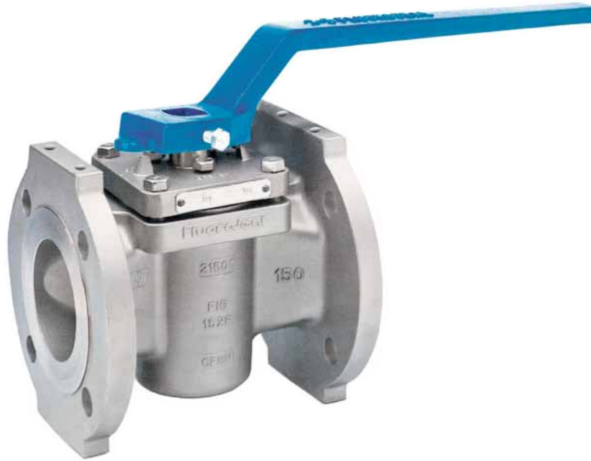
ANSI/ASME Class 150 Lbs FluoroSeal® Plug Valve with Wrench